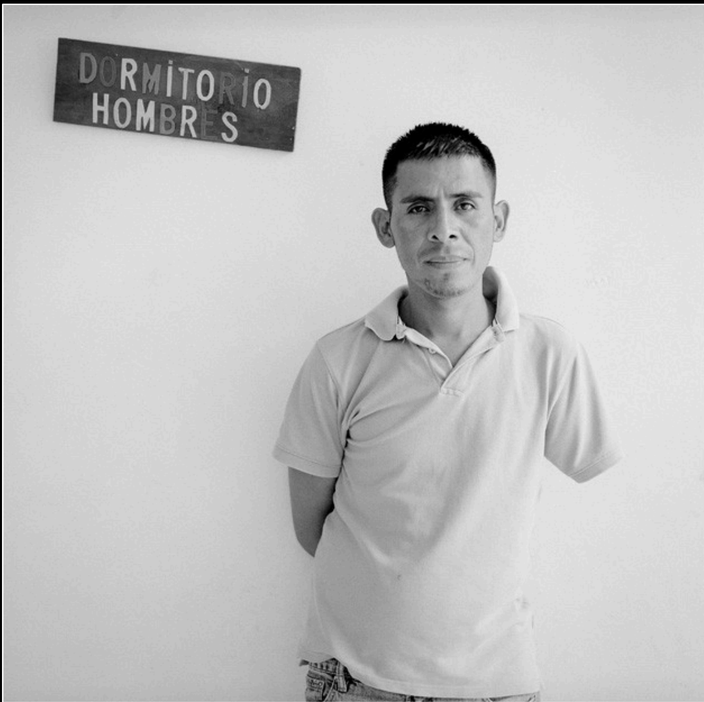
This man, who lost his arm while attempting to travel from Honduras to the U.S. on the train, recovers in a migrant shelter in Mexico. The shelter was made specifically for those who suffered amputations along the journey.