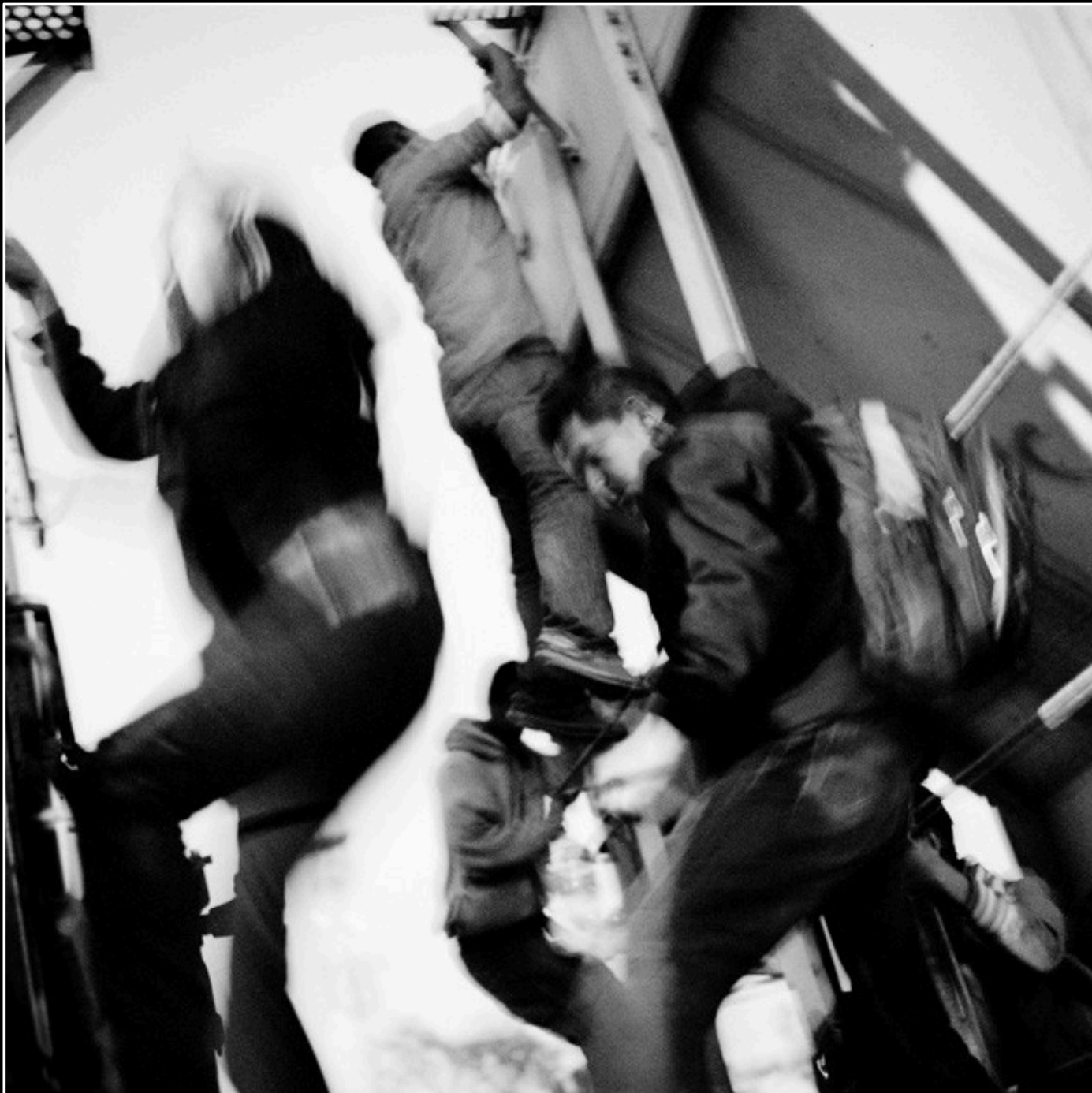
Migrants from El Salvador, Honduras and Guatemala scramble to get on the moving train.