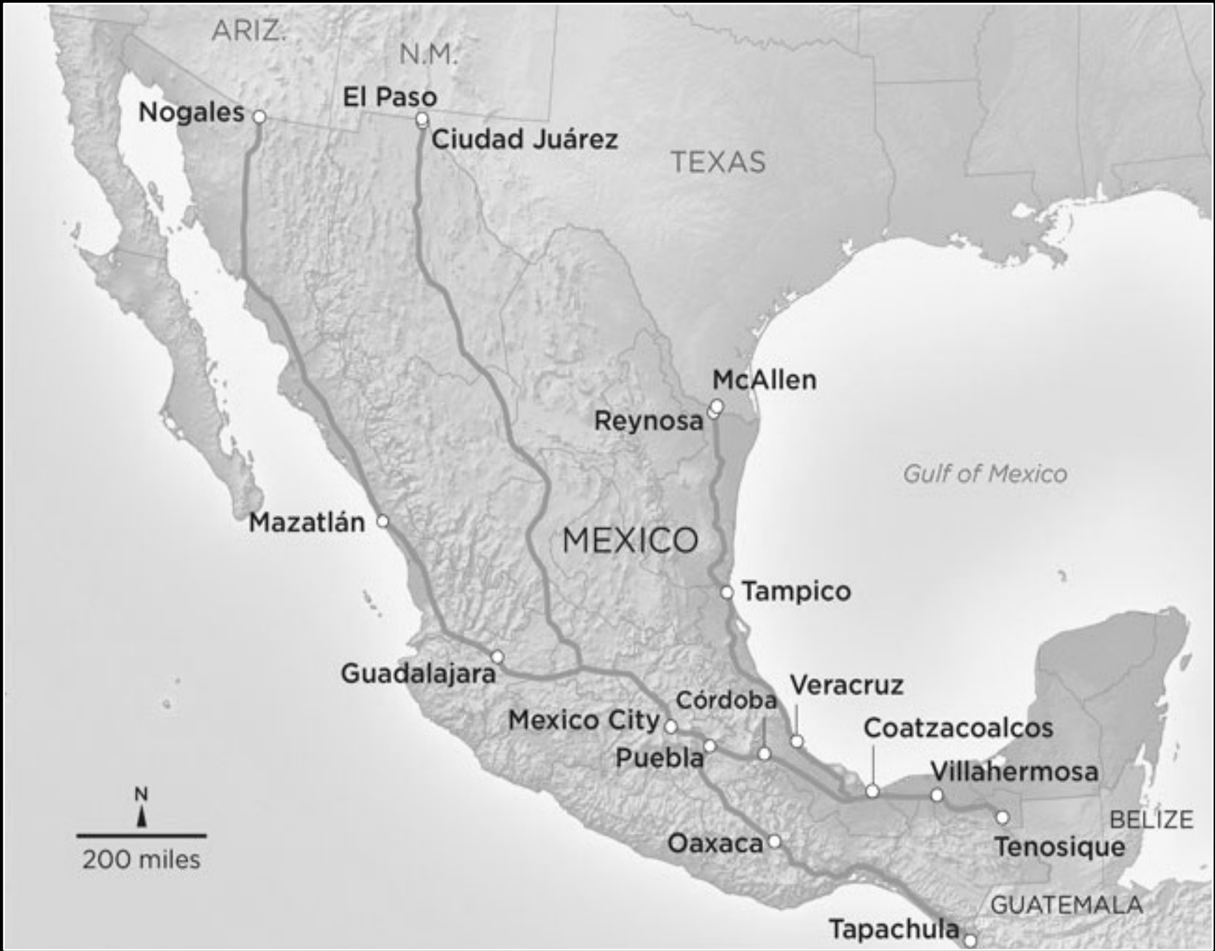
A map of the different routes the trains might take.